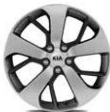
18" Alloys - B Type

'GT-Line S' 1.7 CRDi 139bhp 7-speed auto DCT ISG (116 g/km)