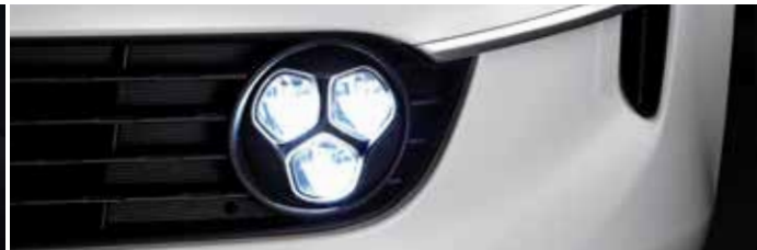
LED front fog lights Stylish and practical, the LED front fog lights illuminate the road ahead when visibility is limited.