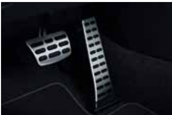
Alloy pedals A must for the sporty driver.

Designed with the utmost attention to every detail and every finish, the Optima is full of ingenious features.