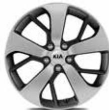
18" Alloys - B Type

'GT-Line S' 1.7 CRDi ISG 139bhp 7-speed auto DCT ISG (120 g/km)