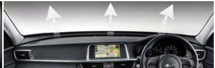
Automatic defog system Clear windows quickly in cold or humid climates to make sure your view is never obstructed.

Features are not necessarily standard across the range.