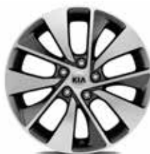
18" Alloys - A Type

'3' 1.7 CRDi 139bhp 6-speed manual ISG (110 g/km)