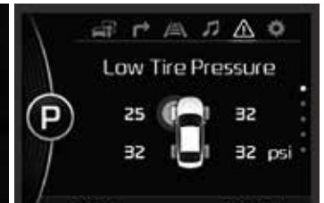
Tyre pressure monitoring system (TPMS) Keeps track of the pressure inside each of the tyres. It tells you which tyre is reporting under-inflation by displaying its pressure on the cluster screen.