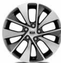
18" Alloys - A Type

'3' 1.7 CRDi 139bhp 6-speed manual ISG (113 g/km)