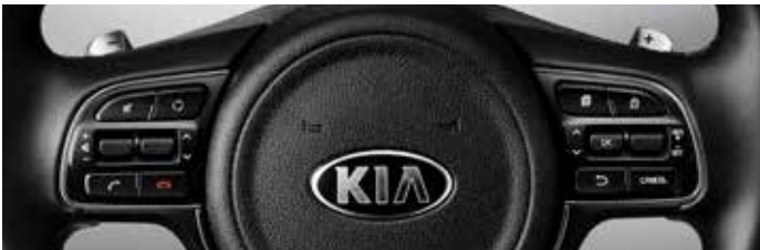
Paddle shift transmission With paddle shifters at your fingertips, gear changes are guaranteed to be lightning-quick. Steering wheel mounted controls. Adjust the volume, change stations – and keep your hands on the wheel with the handy steering-wheel audio remote controls.